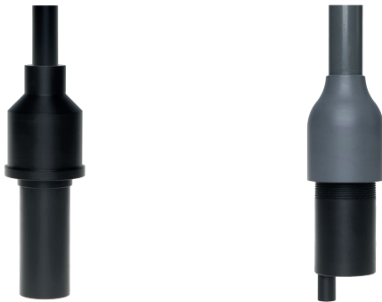
Typical installation of the probes with adapter and installation pipe.

0012.440040 Hose for automatic air injection. Can be used with OD 8325 only.