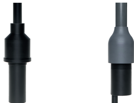
Typical installation of the probes with adapter and extension pipe.

0012.440040 Hose for automatic air injection. Can be used with TU 8325 only.